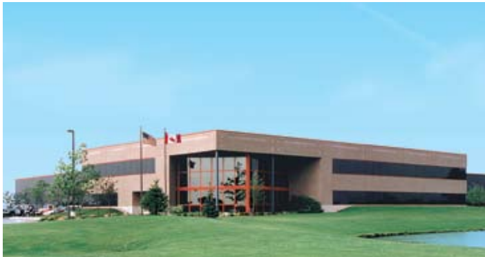
Clockwise from bottom: WaterFurnace International world headquarters. Buckingham Palace utilizes geothermal. A typical geothermal installation.

system as warm air. The same heat energy can also be used for a radiant floor system or domestic hot water heating.