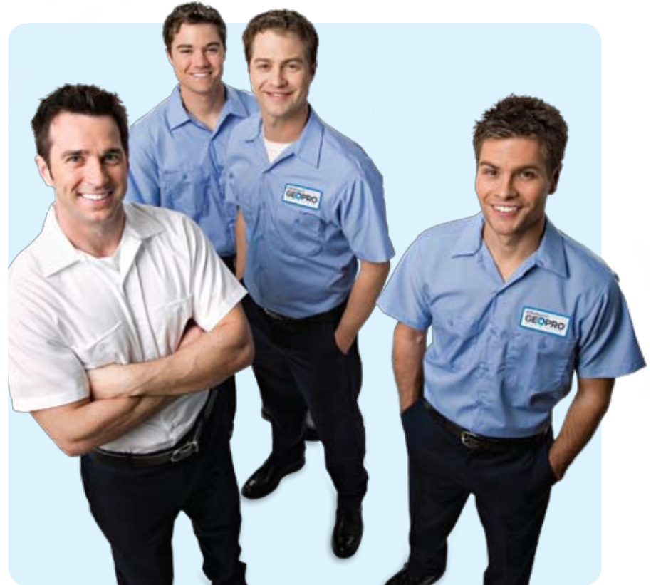
Make sure the manufacturer of the unit has trained your contractor and the contractor has installed geothermal before. Companies like WaterFurnace require in-depth training in order to become a part of the independent dealer network.

Sign a written proposal before work gets started to protect both parties. Specify project costs, model numbers, job schedule and warranty information.